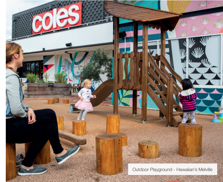
Outdoor Playground - Hawaiian's Melville

For more than 45 years the centre has been a significant part of the community where locals feel welcome. Recent developments created a community space with an outdoor playground, little library, herb gardens and alfresco dining precinct. Hawaiian's Melville also has unique additions including a 24-hour gym, Kirby Swim and K2 Dance Studio.