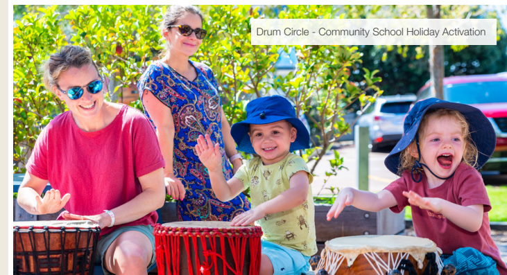
Drum Circle - Community School Holiday Activation