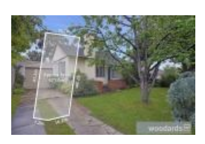
10 Station Av ASHWOOD Sold by Private Sale $2,065,000 Date Sold Apr 2017 Land 671 SqM

Sold by Auction $2,200,000 Date Sold Dec 2016 Land 892 SqM