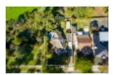
32 Chadstone Rd MALVERN EAST Sold by Auction $2,250,000 Date Sold May 2017

These are the three properties sold within five kilometres of the property for sale in the last eighteen months that the estate agent or agent's representative considers to be most comparable to the property for sale.