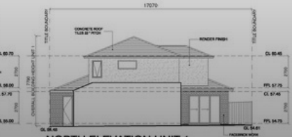
NORTH ELEVATION UNIT 1