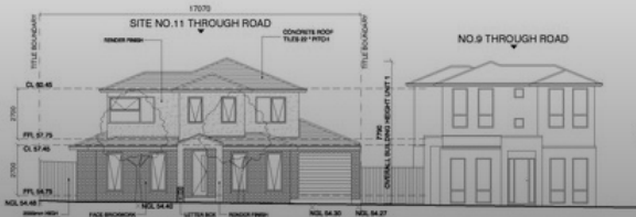
SOUTH ELEVATION UNIT 1 THROUGH ROAD FRONTAGE