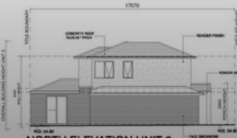
NORTH ELEVATION UNIT 3