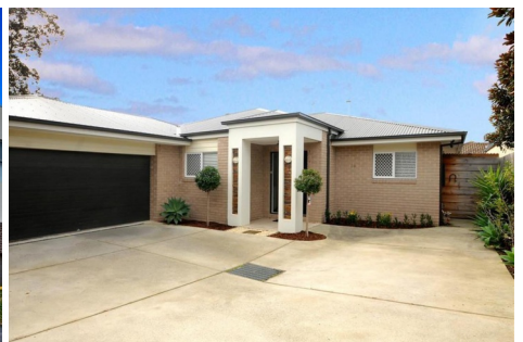
Selected by PREER 3B BLACK STREET, CHELSEA 3196 3 Beds 2 Baths 2 Cars