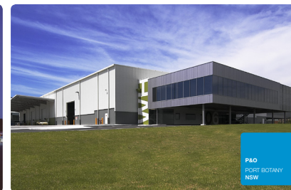
PLO PORT BOTANY NSW