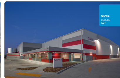
GRACE SUBURB ACT