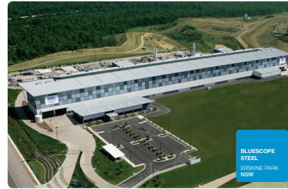
BLUESCOPE STEEL ERSKINE PARK NSW