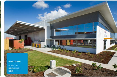
PORTGATE PORT OF BRISBANE QLD