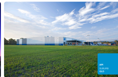
API SUBURB QLD