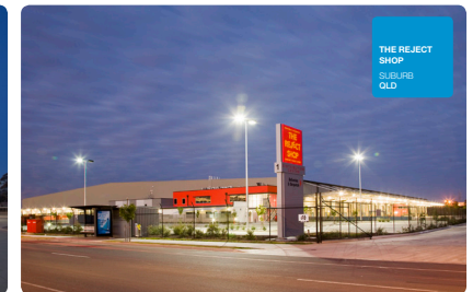
THE REJECT SHOP SUBURB QLD