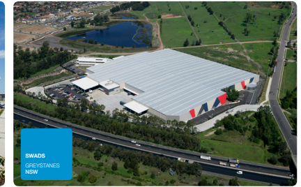
SWADS GREYSTANES NSW