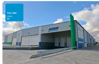
TOLL MX DIREK SA